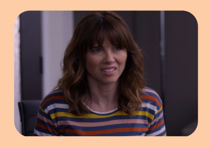
Dead to Me

Episode: Maybe I'm Crazy, Try to Stop Me