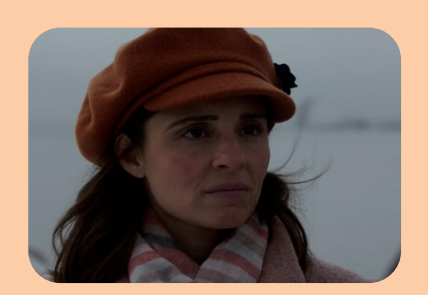
Law & Order: SVU

Jenny, a teen visiting Chicago from Indiana with her parents, presents to the ER with severe abdominal pain, and the doctors discover that she ordered mifepristone online to self-induce an abortion, but the products of conception were retained. The doctors provide her with misoprostol, and after Jenny has medical complications, they insist that she inform her religious mother of what's going on. This is one of the first depictions of a partially successful self-managed abortion in which abortion pills are ordered online, although it exaggerates the risks of misoprostol such that it may confuse viewers about the safety of medication abortion.