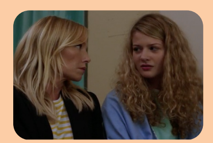
Law & Order: SVU

In this show's second abortion plotline, sex worker and aspiring filmmaker Candy reherses for the part of her film's main character, and it's immediately clear that she's talking about herself. She discloses that she had an illegal abortion as a teenger, and that her Catholic father abandoned her during the procedure, not because of his beliefs, but because he didn't care about her.