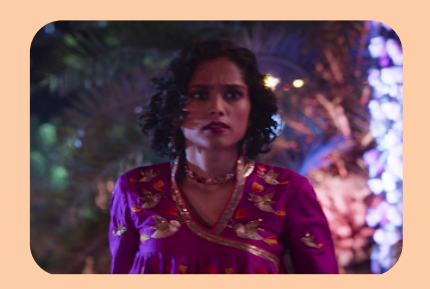
Made in Heaven