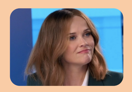
The Morning Show

Episode: That Woman Network: Apple TV+ Airdate: 11/8/2019